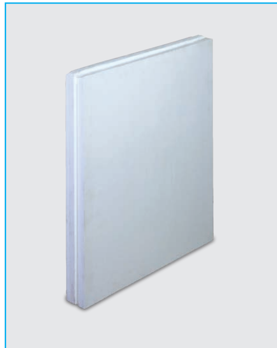
7cm thick gypsum block