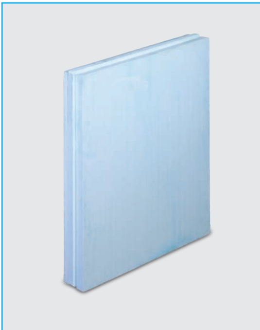
Moisture resistant (MR): 8 cm thick gypsum block